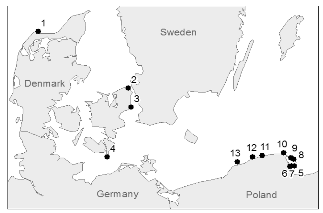
Fig. 1. Sample lications: 1 – Skagerrak, 2 – Gilleleje (Kattegat), 3 – Copenhagen, 4 – Gedser, 5 – Gdańsk Bay, 6 – Gdynia Orłowo – coast, 7 – Gdynia Orłowo, 8 – Jastarnia, 9 – Kuźnica, 10 – Jastrzębia Góra, 11 – Łeba, 12 – Czołpino, 13 – Jarosławiec.